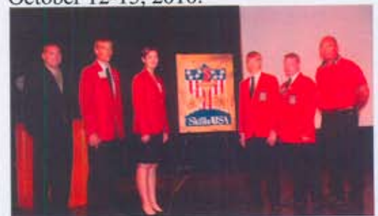
Officers of Bluestem High School and Sponsors

District Fall Leadership Conferences are held to provide: a kick-off activity for the school year, introduce the leadership component of the organization to high school and college/postsecondary students, elect District Officers who become the electors for the State Officer Team at the State Fall Leadership Conference in Hesston at the Cross Wind Conference Center on October 12-13, 2010.