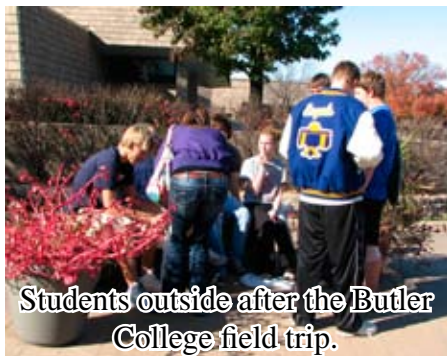
Students outside after the Butler College field trip.