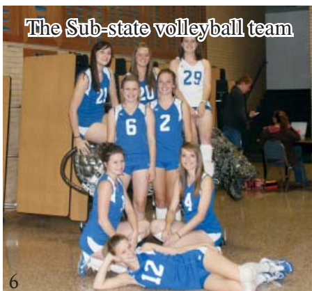
The Sub-state volleyball team