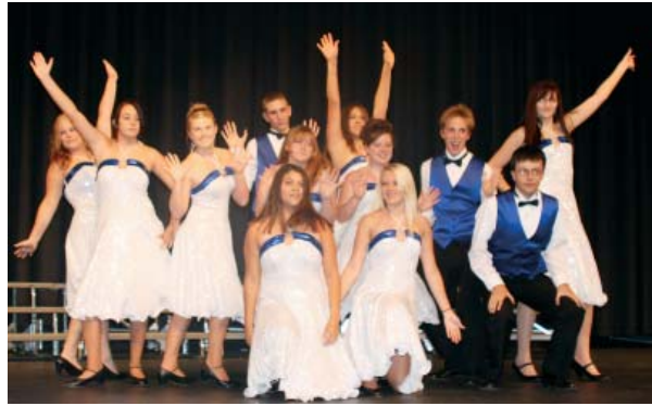
Madrigal singers pose at the end of "I've got the music in me."